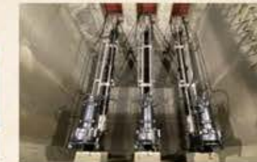
▲ B-series high efficiency submersible sewage pumps, installed at a rainwater pumping station to prevent flooding