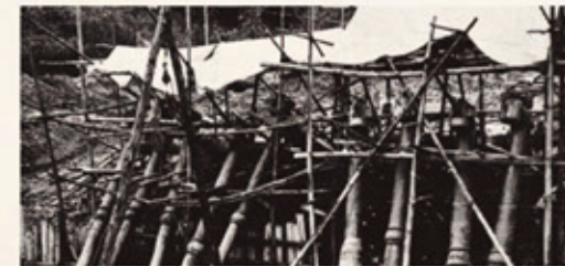
▲ Two-stage TDW vertical shaft pumps at a worksite