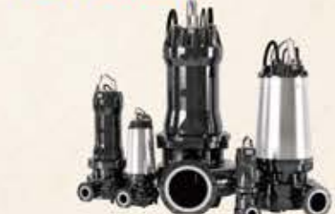
▲ Submersible pumps sold under the TSURUMI AVANT brand