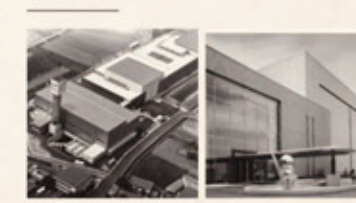
▲ The new Kyoto Plant at the time of completion