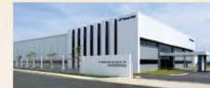
▲ The Vietnam Plant at the time of completion