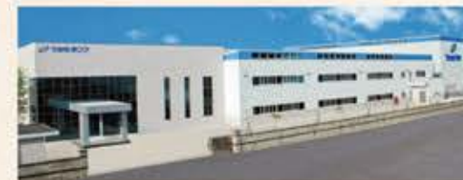
▲ The New Taiwan Plant, which manufactures primarily compact submersible pumps, at the time of its completion