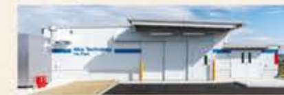
▲ Alloy Technology's Casting Division (Yao Plant) at the time of completion. The facility launched the Tsurumi Group's first casting business. Casting using sand molds created by 3D printers makes it possible to manufacture more precise parts.