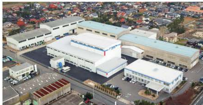
Molding Research Building