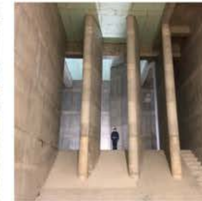
Test-run of a vertical shaft mixed-flow pump with a 1,800 mm diameter