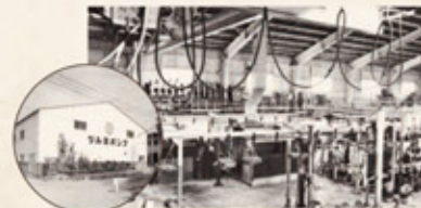
▲ A plant with a production line for large pumps