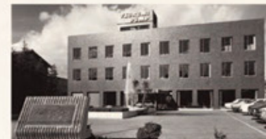
▲ The Osaka Headquarters building (three stories)