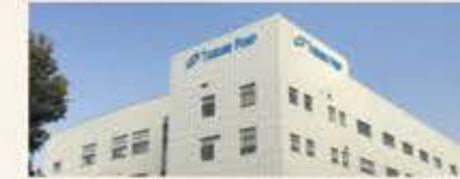
▲ New Shanghai Plant, which combines Vacuum Engineering (which produces vacuum pumps on the first floor) and Shanghai Plant (which produces submersible pumps on the second floor), at the time of completion