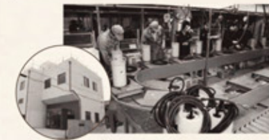
▲ A compact submersible pump production line at the Tsurumi Product Center