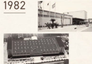
▲ The Kyoto Plant in 1982