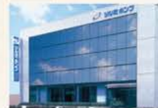
▲ The Tokyo Head Office building