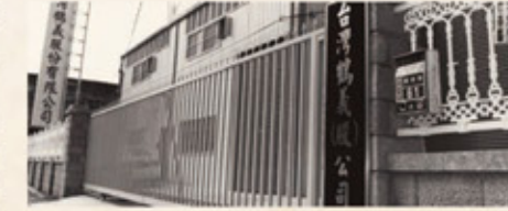
▲ The Taiwan Plant in 1997