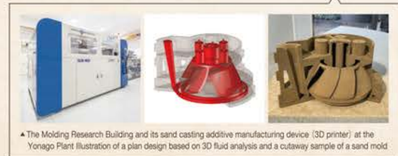
▲ The Molding Research Building and its sand casting additive manufacturing device (3D printer) at the Yonago Plant. Illustration of a plan design based on 3D fluid analysis and a cutaway sample of a sand mold