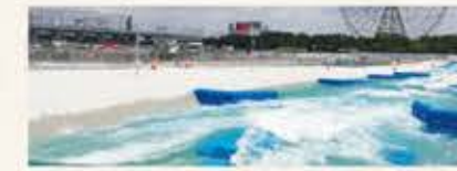
▲ SSP-1350GS submersible column pumps (with a 1,350 mm discharge bore and output of 350 kW), some of the largest pumps of their kind in Japan, helping generate waterflow on an artificial canoe slalom course