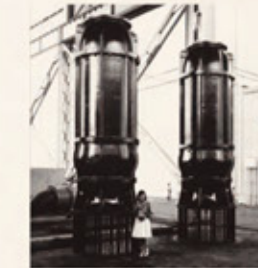
▲ Two TDS-1000MXS pumps delivered to a pumping station in Nagano Prefecture