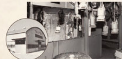
▲ Automatic painting and drying equipment at Tsurumi's compact submersible pump plant