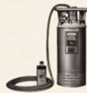
▲ EP submersible pump, the first pump of its kind to be commercialized