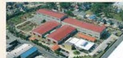
▲ Awamura Manufacturing (present-day Yonago Plant)