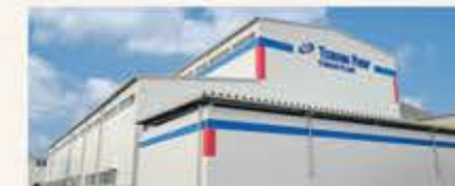
▲ The New Large Pump Production Building, which houses a large, 3,500 m 3 testing tank that's 11 m deep, at the Yonago Plant at the time of completion