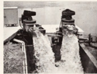
▲ A pair of TDL vertical shaft pumps feeding irrigation water into an irrigation canal