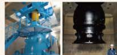
▲ Tsurumi vertical shaft mixed-flow pump with largest discharge bore delivered to a pumping station in Nagano Prefecture (with a 1,800 mm discharge bore and output of 420 kW)