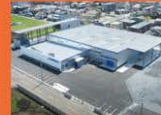
Tsurumi East Japan Logistics