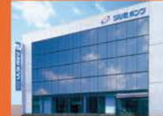
Tokyo Head Office