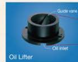
▲ The Oil Lifter and cutaway view of a CZ pump