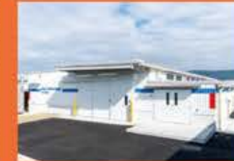
Alloy Technology Casting Division (Yao Plant)