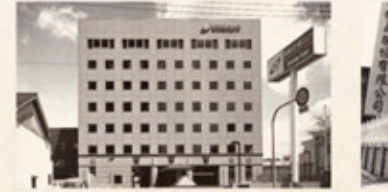
▲ The Osaka Headquarters building at the time of completion