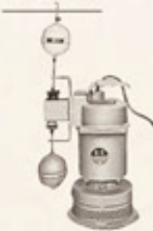
▲ TB float type automatic submersible pump for facilities applications