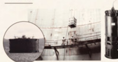
▲ Submersible pumps at work on a caisson of the Akashi-Kaikyo Bridge and KRS-1437 submersible seawater-resistant pumps used in caisson construction