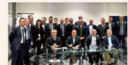
▲ Investment in ZENIT (Italy)