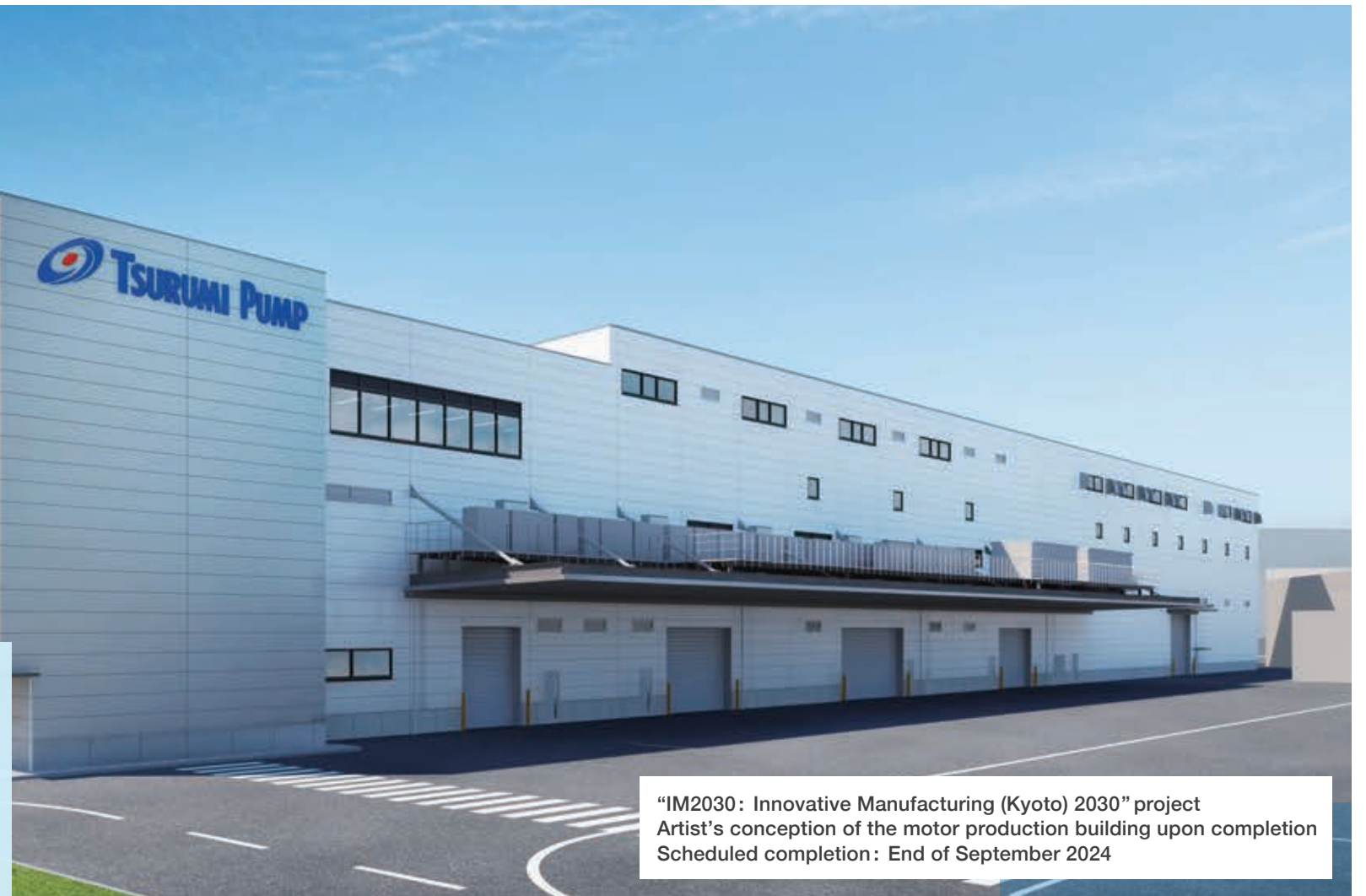
“IM2030: Innovative Manufacturing (Kyoto) 2030” project Artist’s conception of the motor production building upon completion Scheduled completion: End of September 2024

Recently, the facility launched the “IM2030: Innovative Manufacturing (Kyoto) 2030” project to promote manufacturing innovation with a view towards the next 100 years. As part of that project, the plant is constructing a motor production building to symbolize manufacturing at Tsurumi as the company looks to the next generation. Tsurumi welcomes your high expectations with regard to the future evolution of the Kyoto Plant.